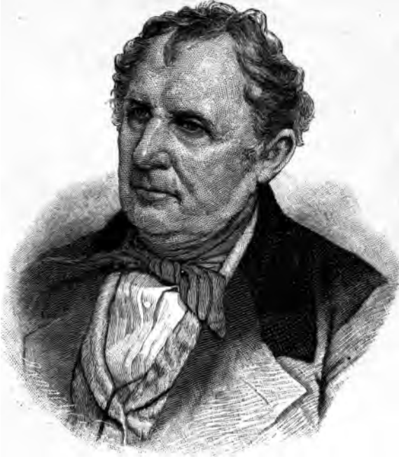
J. Fenimore Cooper